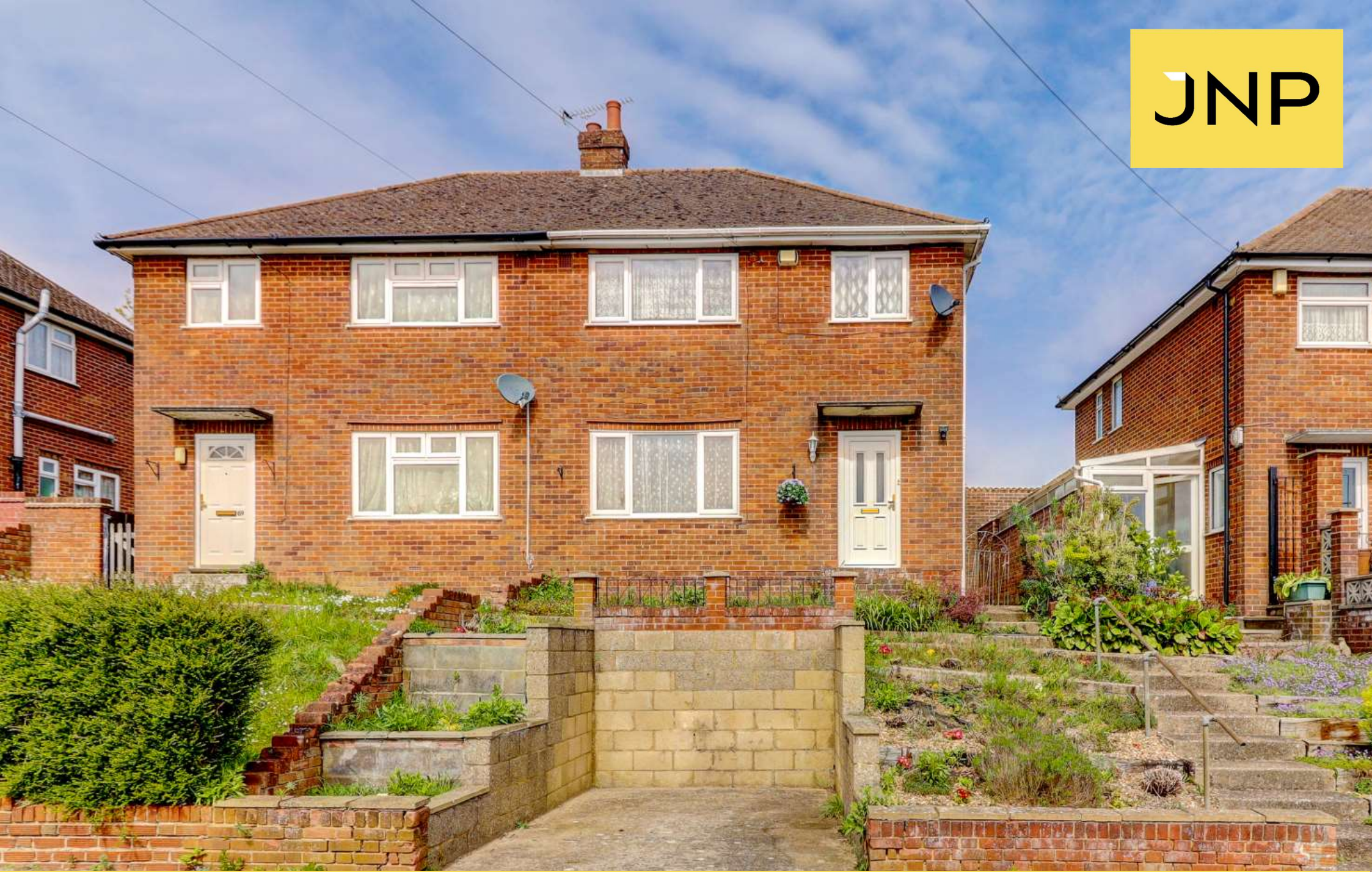
71 Hillary Road, High Wycombe, Buckinghamshire, HP13 7RB Asking Price £385,000 Freehold