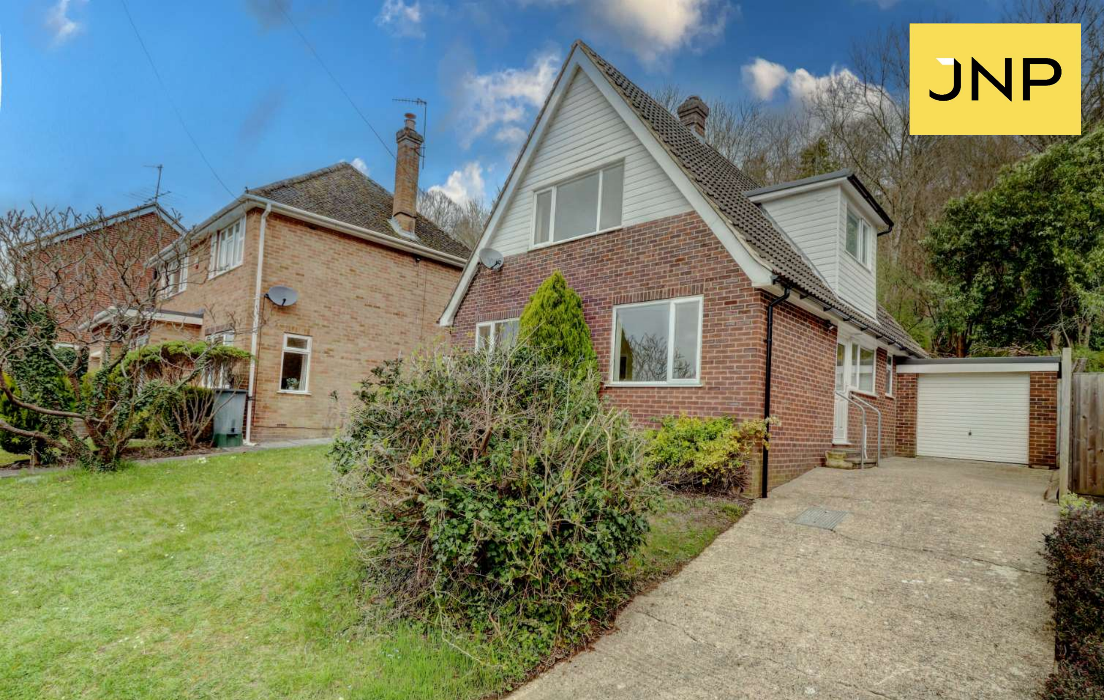
45 Friars Gardens, Hughenden Valley, High Wycombe, Buckinghamshire, HP14 4LT Offers Over £600,000 Freehold