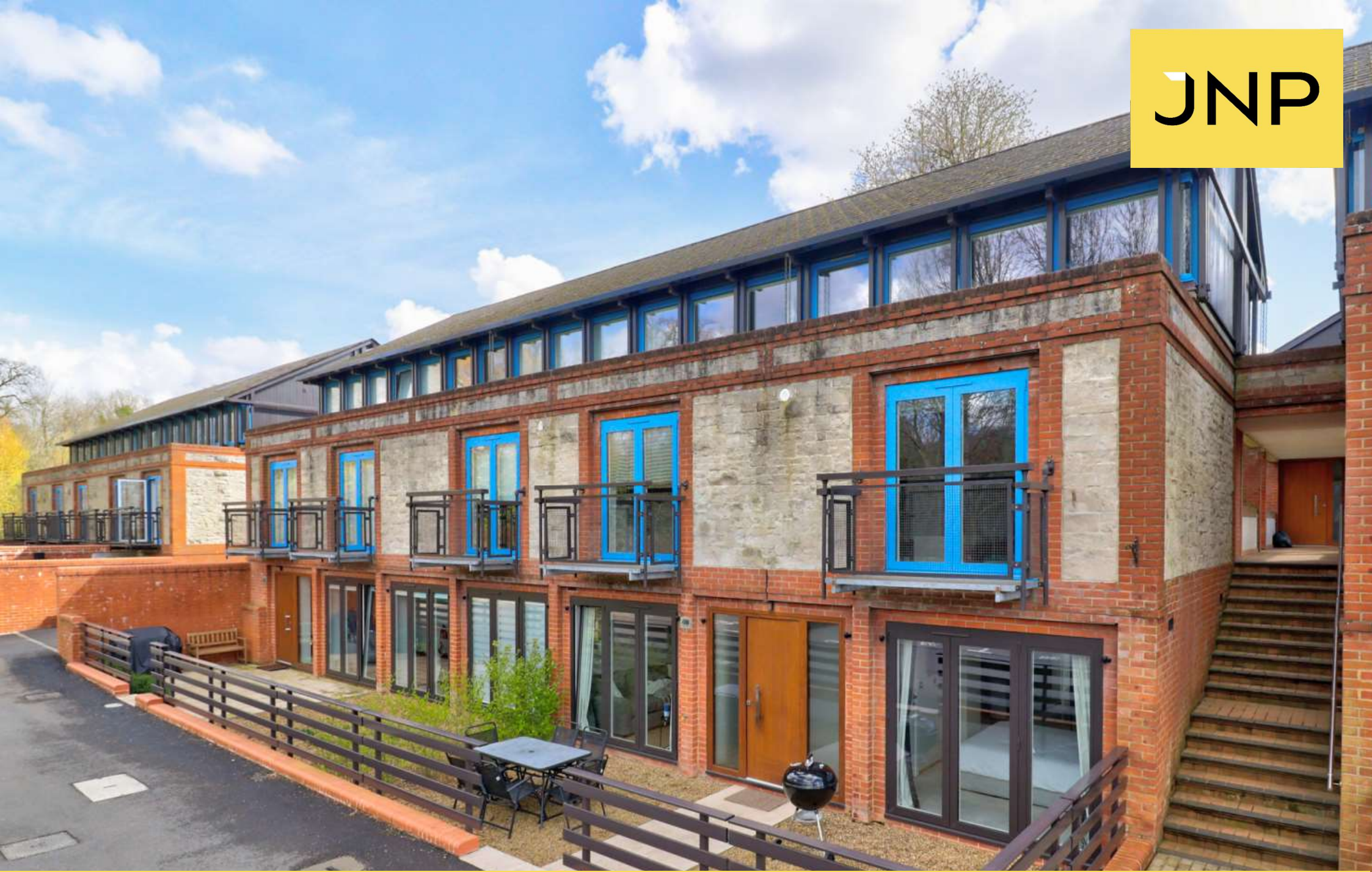
Flat 8, Uplands House, Four Ashes Road, Cryers Hill, HP15 6DY £260,000 Leasehold