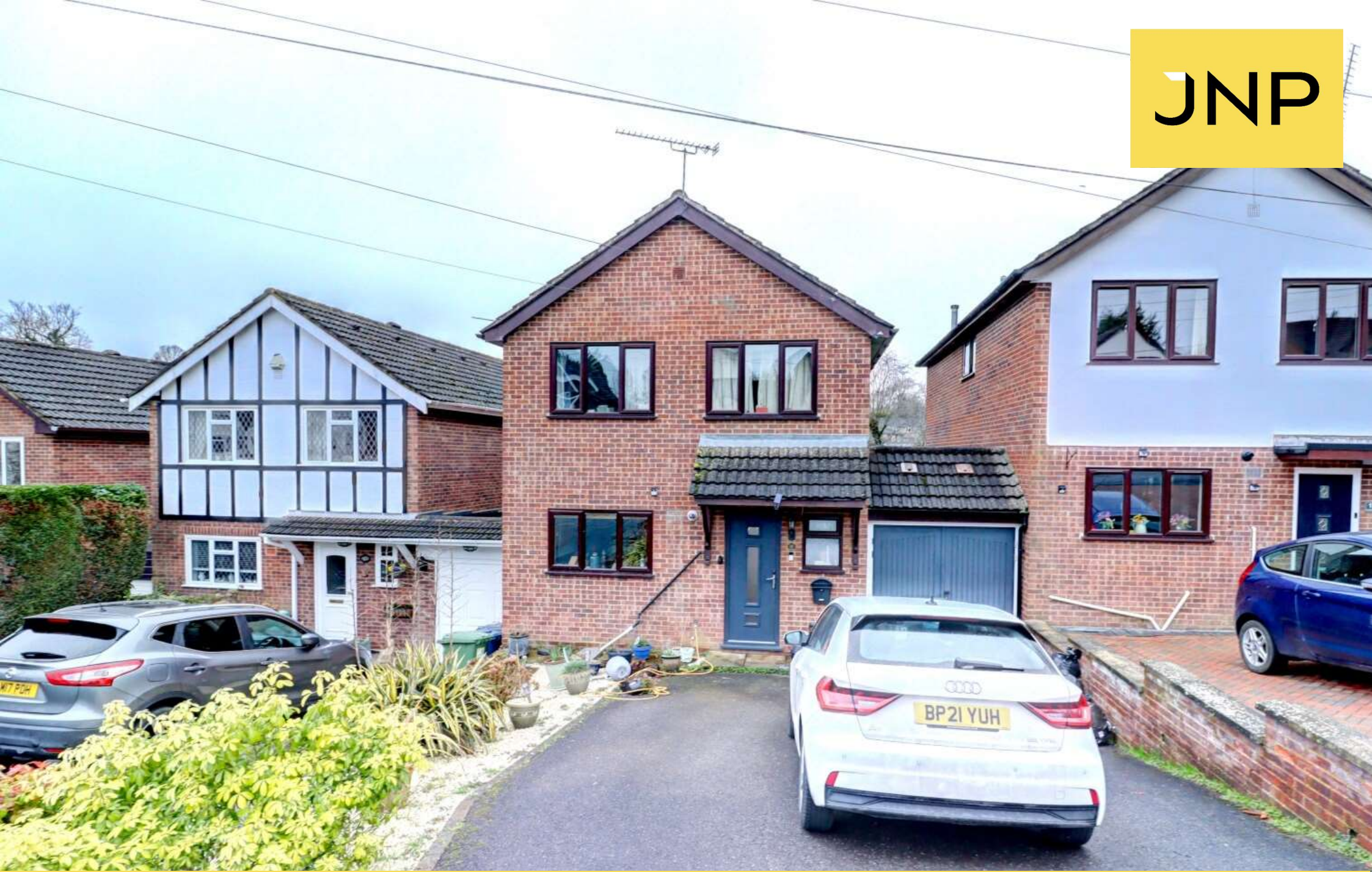
18 Sunny Bank, Widmer End, HP15 6PA £575,000 Freehold