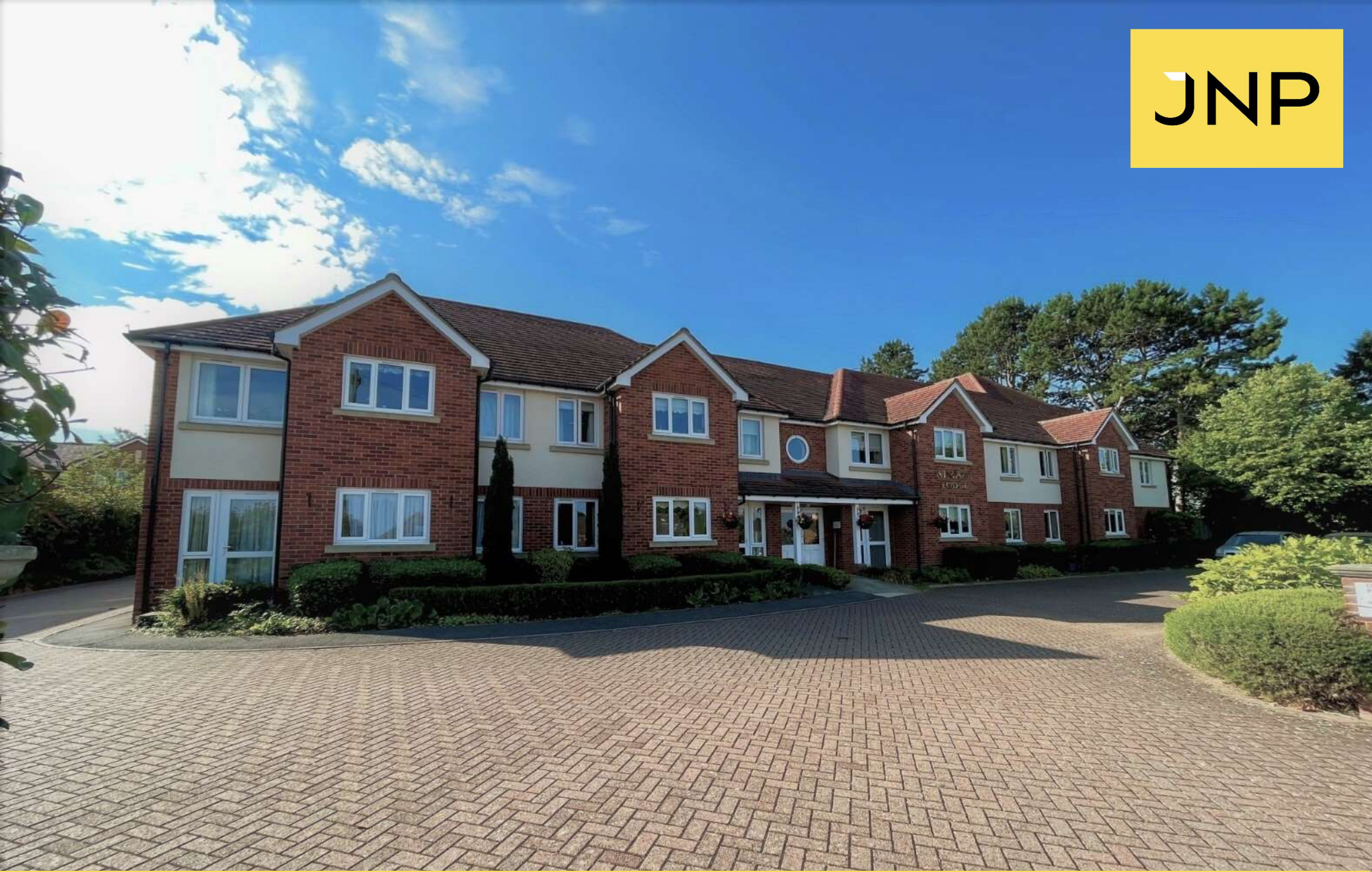
45 Windsor Lodge, Wellington Avenue, Princes £269,000 Leasehold