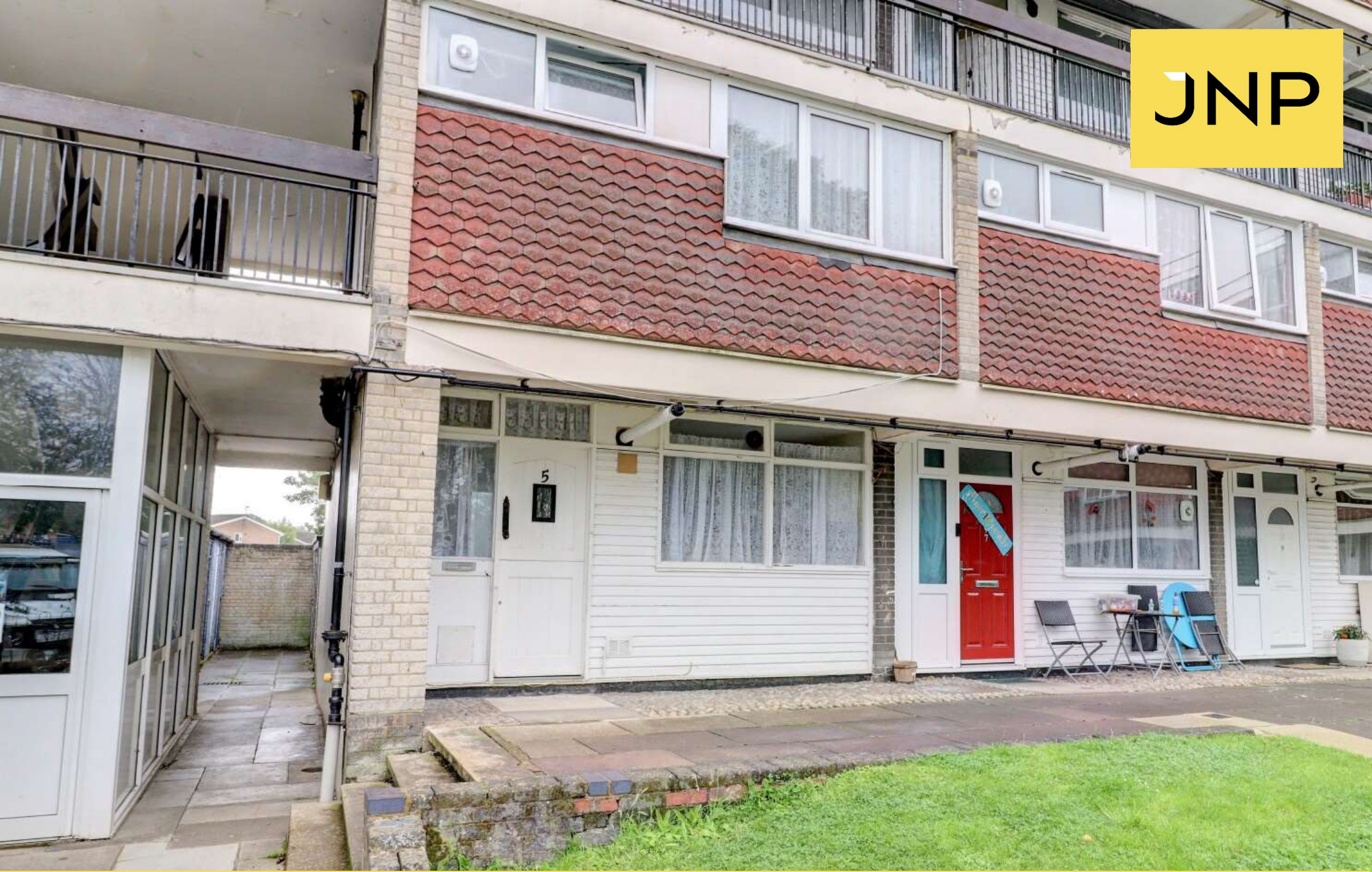
5 Hazell Road, Prestwood, Great Missenden, HP16 0LR £160,000 Leasehold