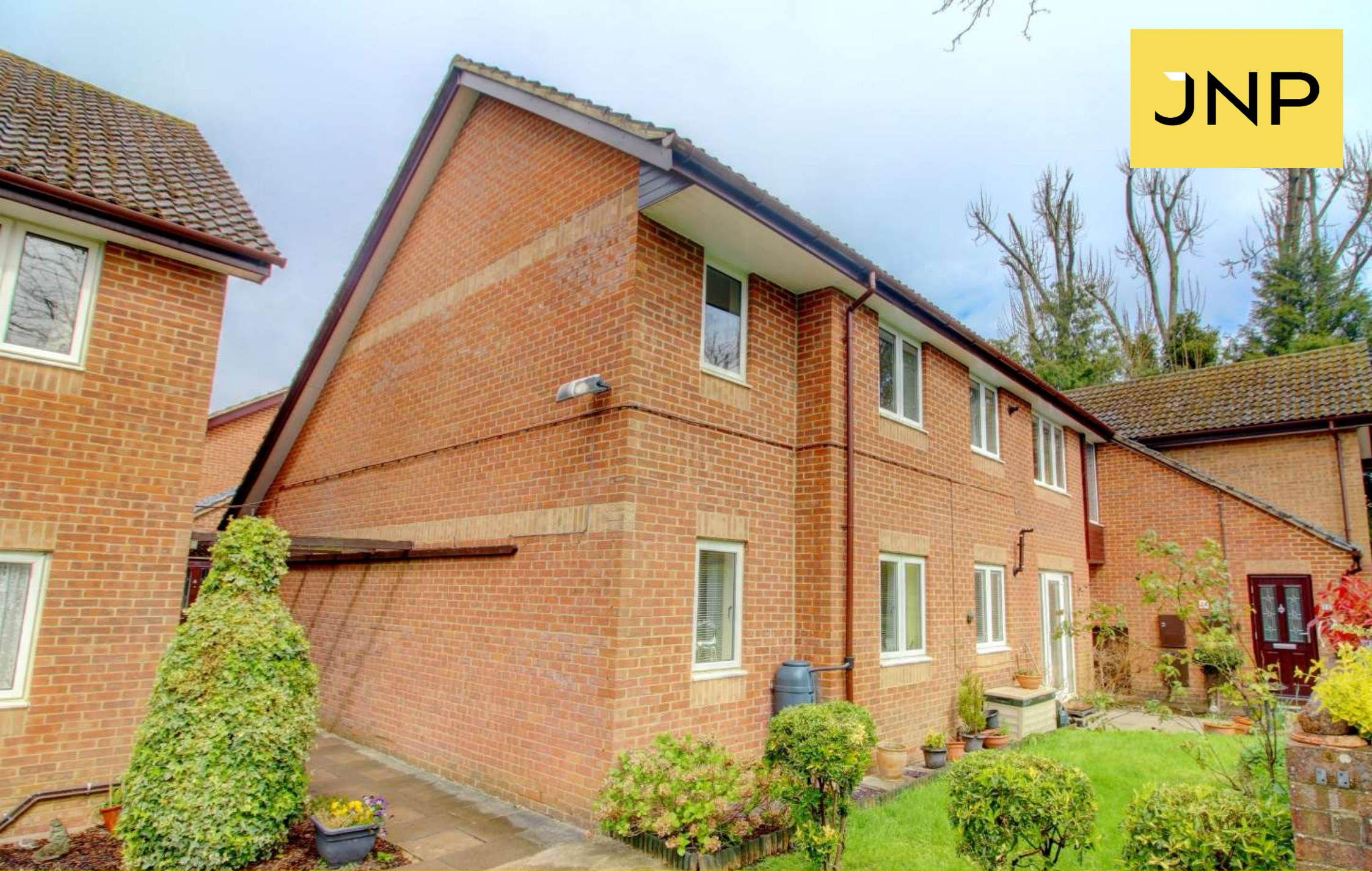
22 Rosewood Gardens, High Wycombe, Buckinghamshire, HP12 4RU Asking price £110,000 Leasehold